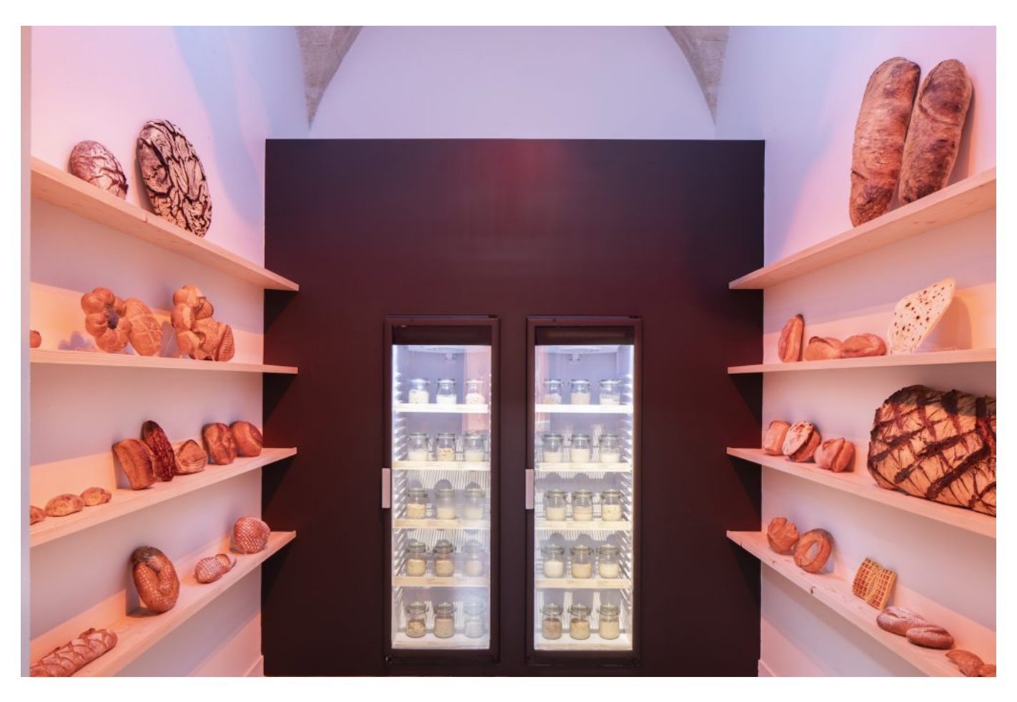
"Sourdough, the unsuspected matrix of bread" Exhibition Farmer designers, an art of living at the madd-bordeaux Cultural season Ressources / Bordeaux 2021