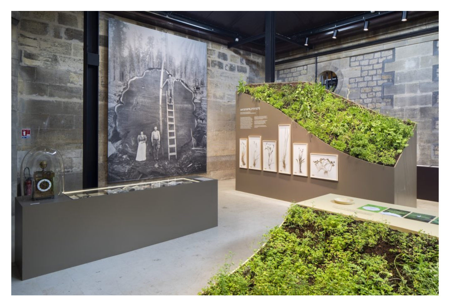
Exhibition Farmer designers, an art of living at the madd-bordeaux Cultural season Ressources / Bordeaux 2021