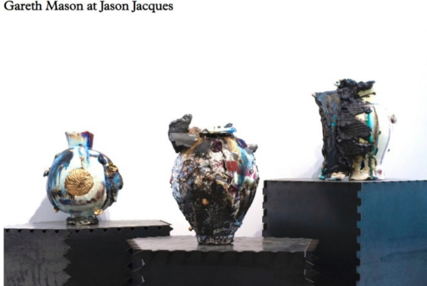
Installation view of Wild Clay at Jason Jacques Gallery.

Acclaimed British ceramist Gareth Mason's latest show at Jason Jacques Gallery in New York celebrates the un-tamability of the artist's chosen medium. Wild Clay features a selection of Mason's expressive, sculptural vessels—complex pieces, rich in form and texture, seductively wearing bits of wild clay alongside repurposed shards of pottery and droplets of gold luster. On view til August 14th.