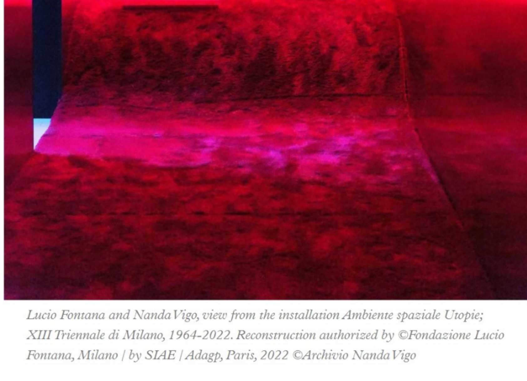
Lucio Fontana and Nanda Vigo, view from the installation Ambiente spaziale Utopie ; XIII Triennale di Milano, 1964–2022.

This website uses cookies to improve your experience. For more information, visit our Terms of Service and Privacy Policy .