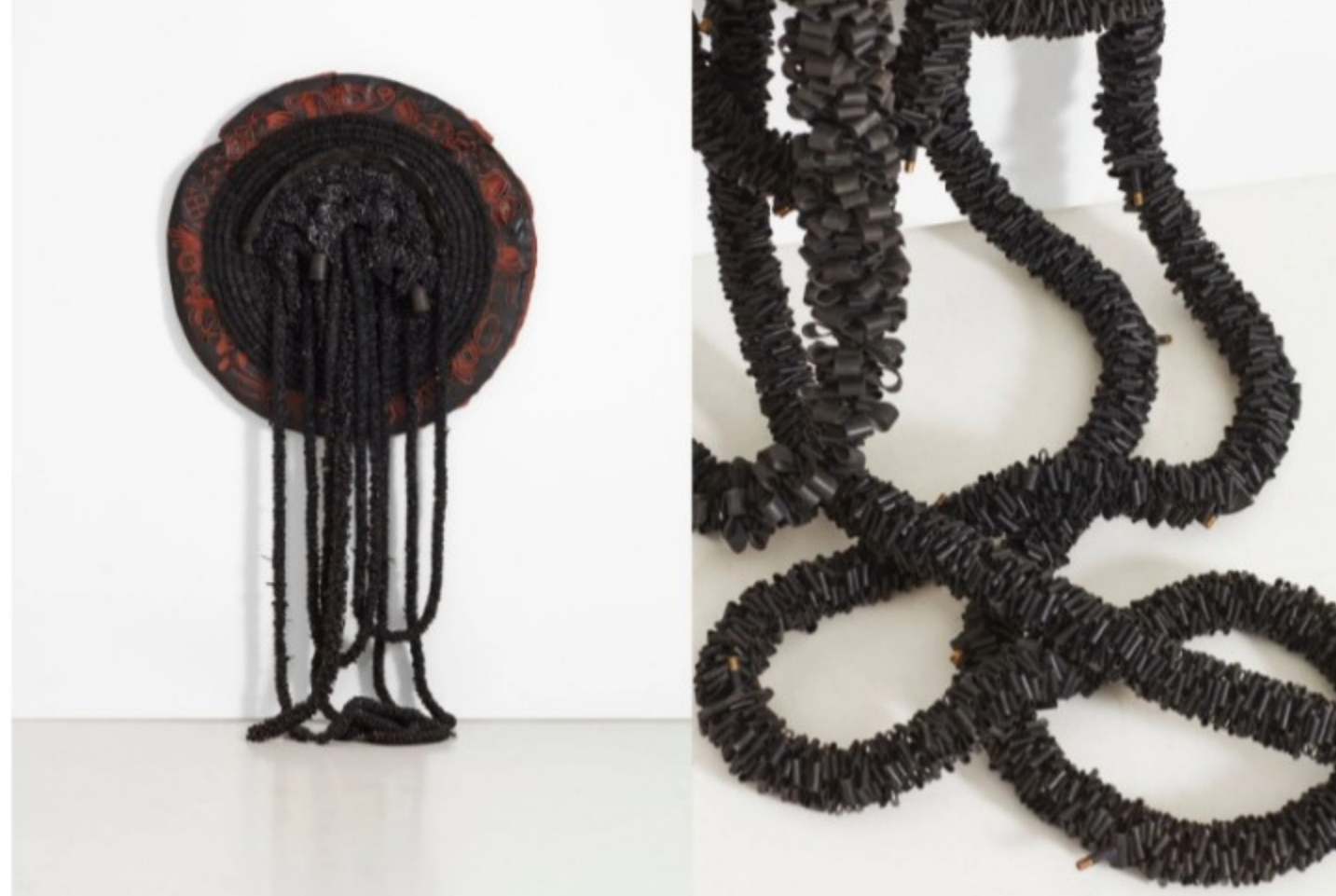
Portal by Patrick Bongoy

This week, Southern Guild opens Unseen Dimensions of the Known , a solo show featuring work by South African-based, Congolese artist Patrick Bongoy. The exhibition includes sculpture, tapestries, painting, and site-specific installations in hessian and rubber. Bongoy upcycles stockpiles of industrial rubber (often the inner tubes of tires), and manually works the material—stitching, weaving, cutting, wrestling and manipulating—to transform it into various states of textile-like plasticity. His latest pieces continue to reflect on his native DRC's past and present, but also considering the broader human condition, inquiring into our personal and collective liberation and purpose. Open 'til September 29th