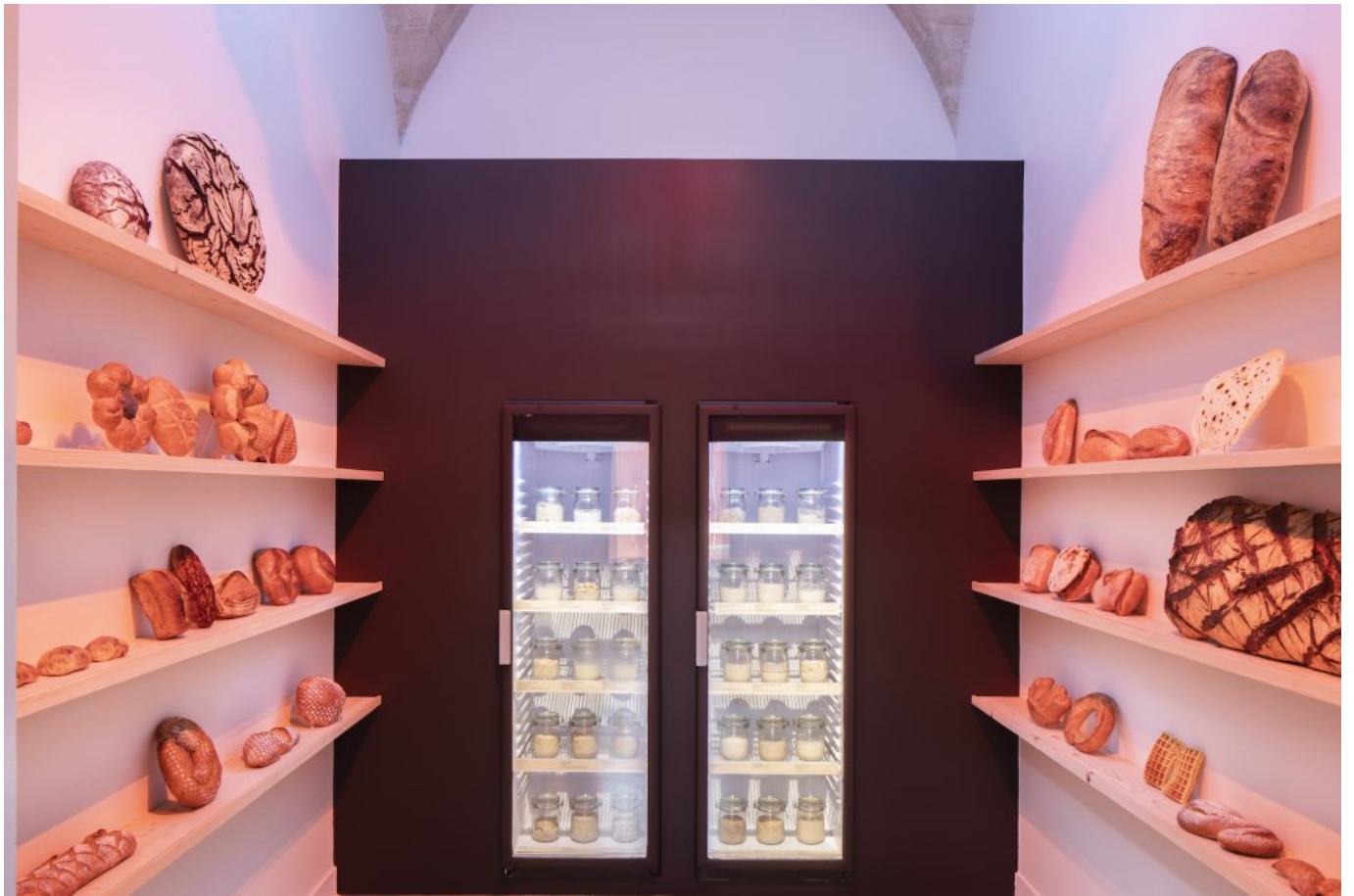
"Sourdough, the unsuspected matrix of bread" Exhibition Farmer designers, an art of living at the madd-bordeaux Cultural season Ressources / Bordeaux 2021