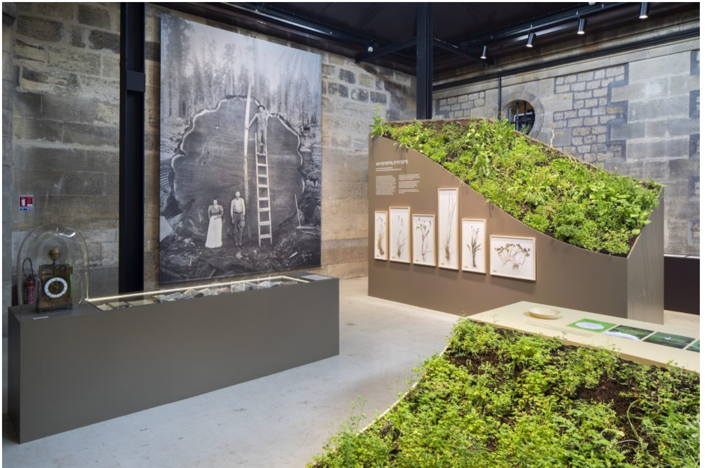
Exhibition Farmer designers, an art of living at the madd-bordeaux Cultural season Ressources / Bordeaux 2021